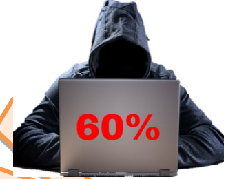
60% of Australian Businesses Experienced a Ransomware Incident

The recent high-profile infection of ransomware 'WannaCry' made headline news in over 100 countries because once this infection was in a network, it spread through the entire system on its own. This means you don't have to be big enough to catch a hacker's attention, as the virus is designed to spread to as many computers as possible, without consideration of size or type of business.