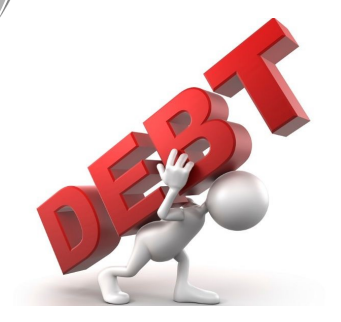
Continues Next Page