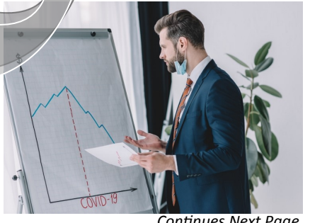
Continues Next Page

Typically, your forecast should project cash flow for the next 12 months but right now, the next 3 to 6 months is essential. Keep updating it at least every month as you get more information and certainty around revenue and costs.