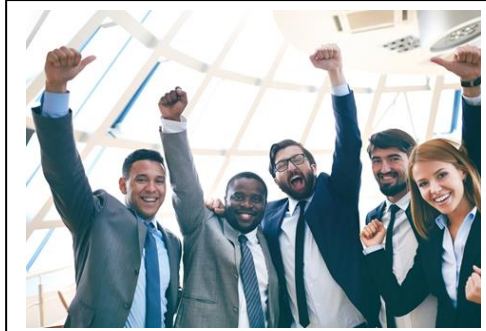
Millennials on average start a business 8 years earlier than their parents' generation.

Over the past 8 years we have helped dozens of firms re-brand. Don't underestimate the value and importance of your brand. The millennials expect a modern, fresh and creative look and they will pass judgement on your firm in a split second based on your online presence. Get it right and you will enjoy the spoils because online marketing is relatively inexpensive and works 24/7/365.